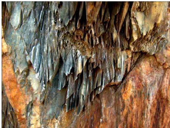
Sharp - Theme, Texture (26)