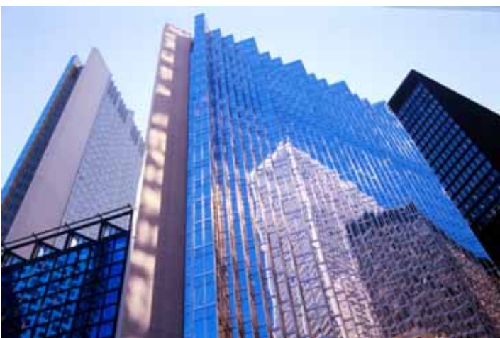
Building Horizontal - Landscape (26)