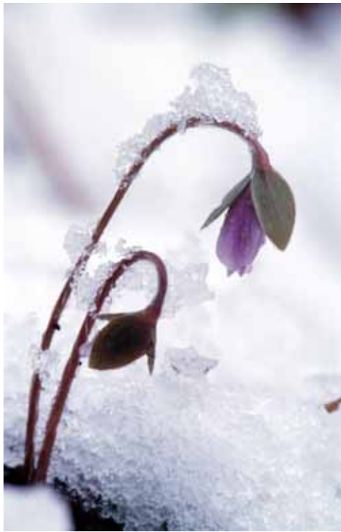
Hepatica and Snow - Hepatica (24)