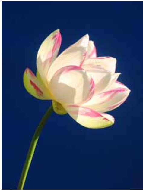
Lotus - Other (25)