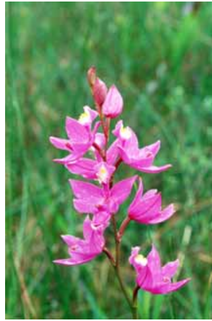
Achala Mishra Calopogon Orchid - Nature (24 tie)