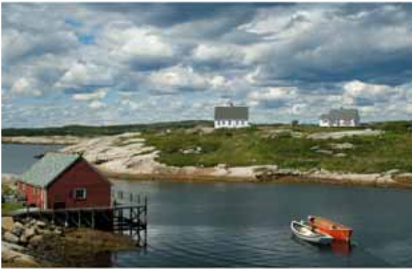
Peggy's Cove – Landscape (26)