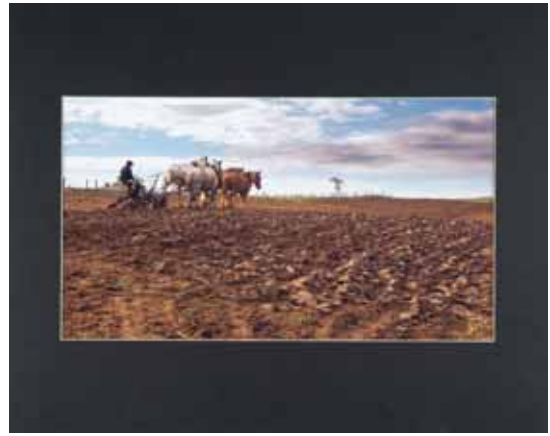
Long Day Ahead – Other (25)

Creating other documents: There are a number of other types