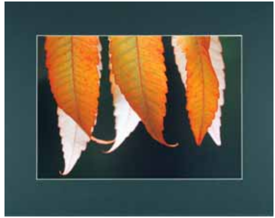
Falling Colours – Nature (24)