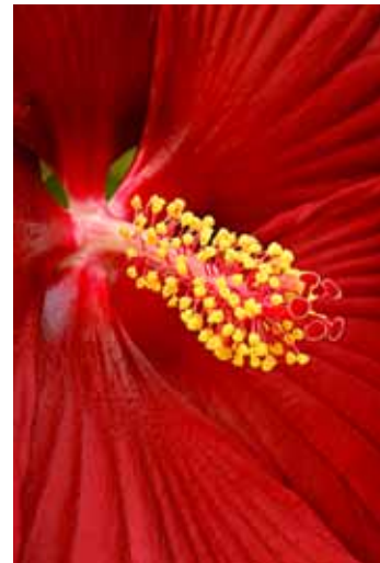
Rose Mallow – Other (25)

2006-12-04: Round 2 images due, Theme—Abstract