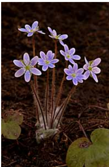
Hepatica 047 – Hepatic Competition (26)