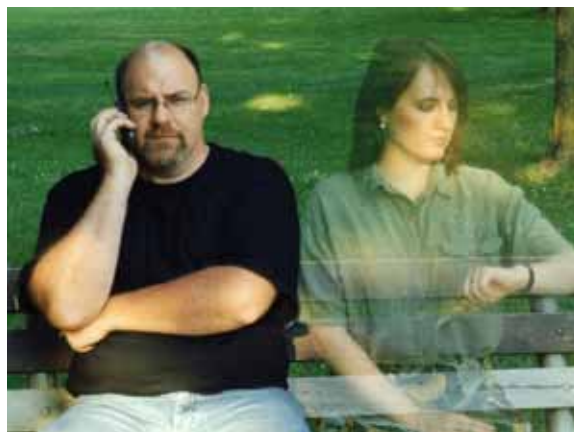
Late Again – Portraiture (23)