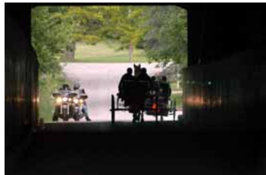
Sunday Drive – Travel (26)