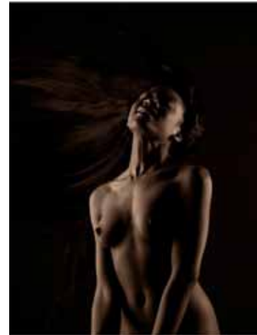
Untitled 1 – Fine Art (27)