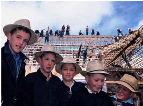
Barn Raising – Portraiture (23)