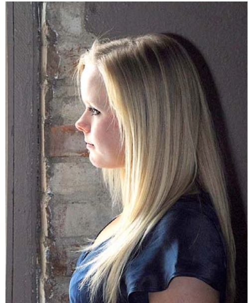
Natural Light – Portraiture (23)