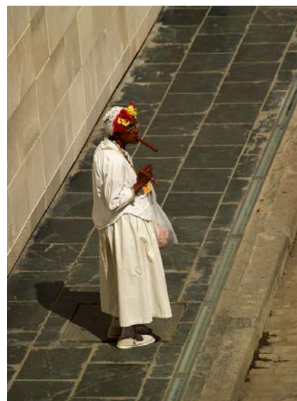
Alone – Travel (22)