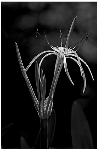
Spider Lily – Fine Art (24)