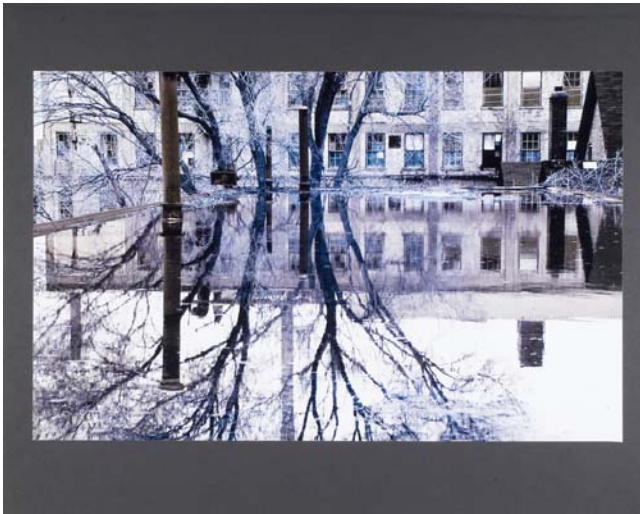
Graceless – Urban (23)