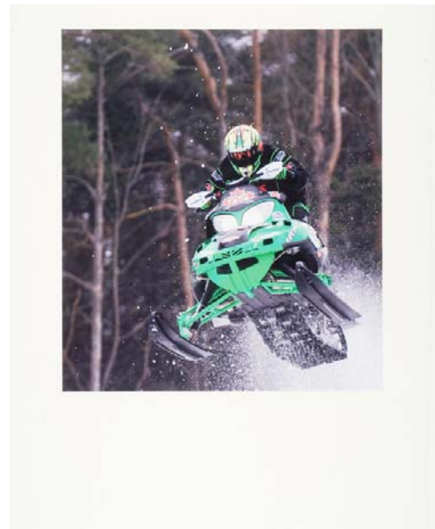
Big Air – Other (24)