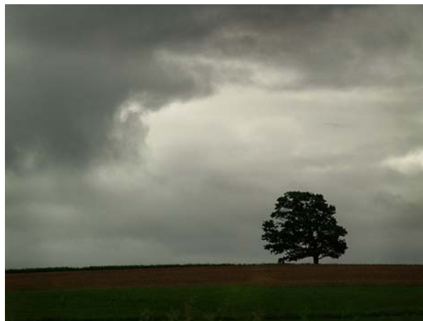
Alone 2 – Landscape (24)

Bring your spouse, or a friend - all are welcome. Ticket cost is LESS than last year at $30 per plate. Tickets MUST be purchased in advance - contact Carol Rawlings or Bill Brath to get your ticket now. Latecomers without tickets are also welcome, but a $5:00 cover charge will apply to cover the room rental and will need to order dinner off the menu (if desired). See you there!