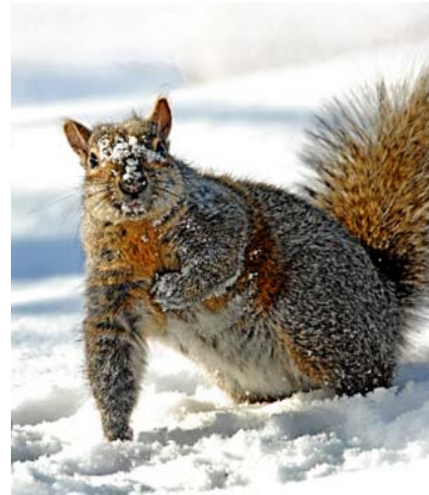
Red Squirrel – Nature (24)