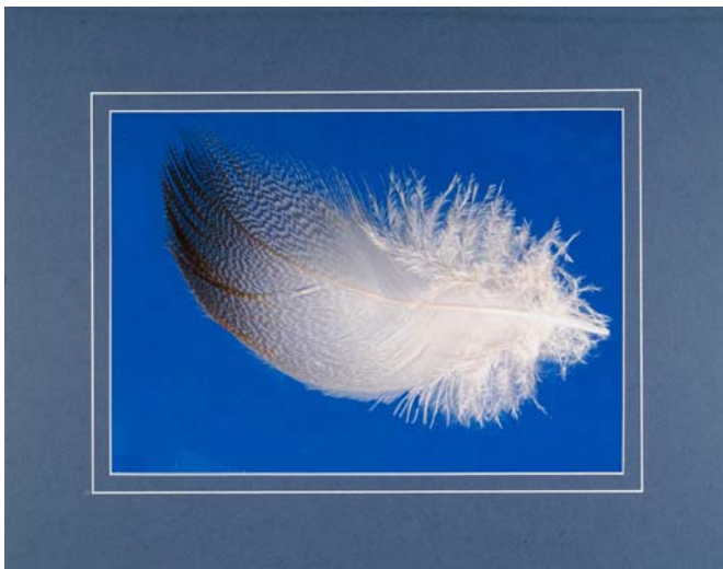
White Feather – Theme (26)

Hepatica images are judged along with the first round and presented at the beginning of the new club year in September.