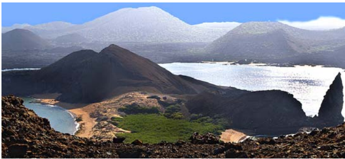
Galapagos – Landscape (24)