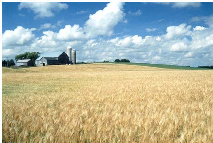
Garden Harvest – Landscape (24)