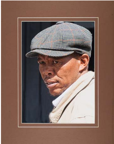
Leaderman – Portraiture (23)