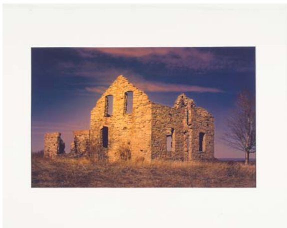
Forgotten Farmhouse – Landscape (24)